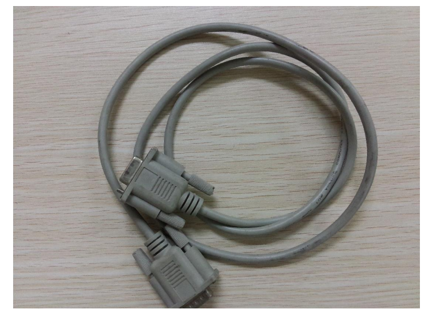
A serial port cable