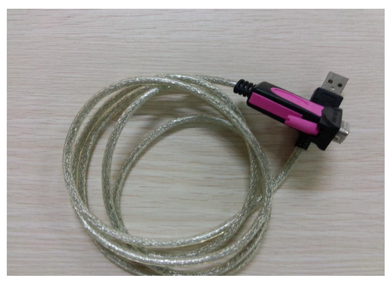
A USB cable to serial port

(2) connecting line : UPS dedicated RS232 9 pin serial port or USB cable, for customers to use RS - 232 serial port connecting, connect one end of the female head on UPS system RS - 232 communication port, male head connect the computer serial port (if the USB to serial port line can be directly on the computer's USB port). If the system only 25 pin of the communication port, user can use 9 pin on the 25 pin connector to connect; For customer use USB connecting , with a dedicated USB data communication line to the computer connected to the UPS. Three kinds of connections line as shown in figure.